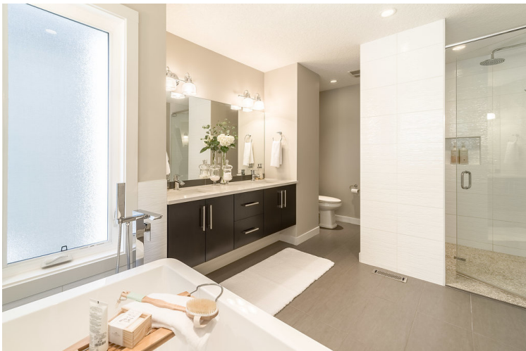
Ensuite w/ soaker tub, dual vanities, dual shower

Crescent Heights shares both NW/NE quadrants, flanked by Centre St and Edmonton Trail. Voted one of Calgary's top 10 most WALKABLE neighborhoods!