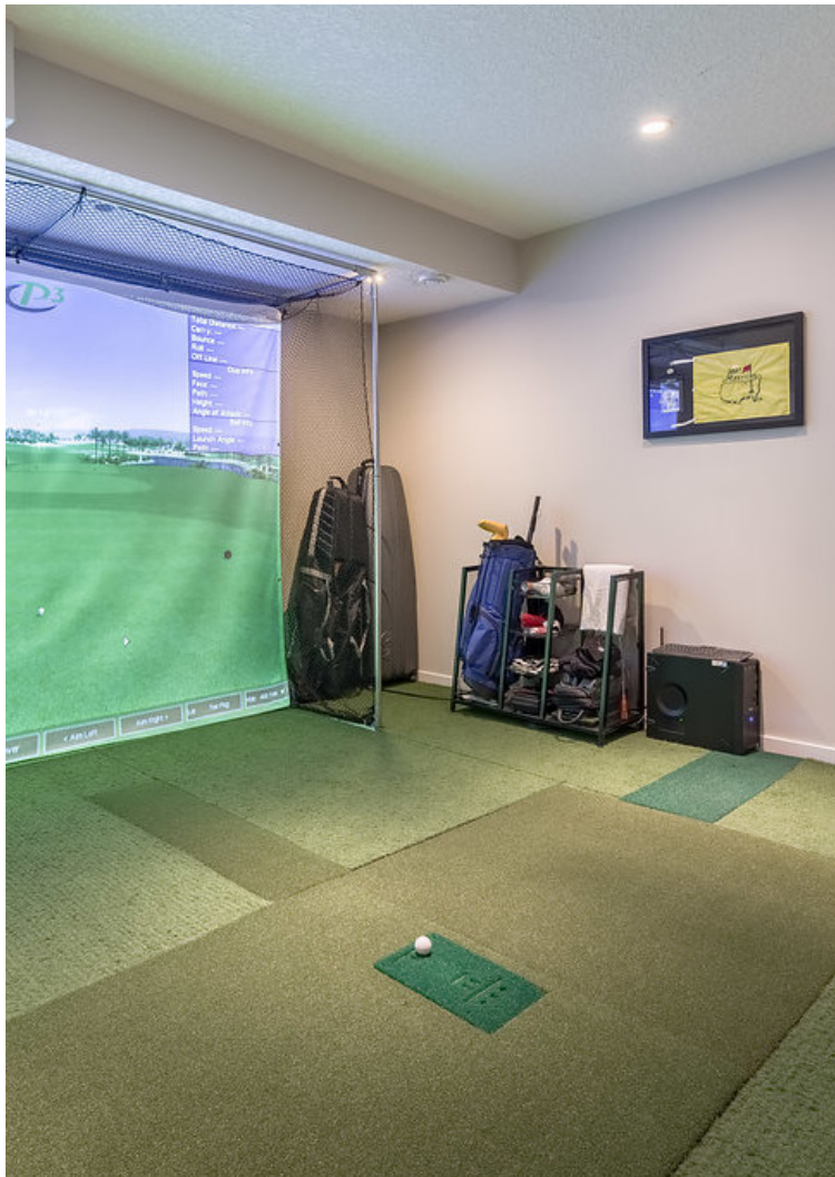
Golf simulation OR theatre room

Prime Crescent Heights location with sweeping downtown and river VIEWS! Enjoy the Inner City lifestyle with an easy stroll to downtown or thru Rotary Park located around the corner. Take advantage of the area amenities and bring the kids to the Splash Park or play a round of Tennis or join the Lawn Bowling league. This modern three storey home offers lovely clean line detailing and finishings with a coffered ceiling, wine wall, A/C, heated floors, heated garage, built-in sound and motorized custom draperies. You'll love watching the Canada Day fireworks from your upper patio or relaxing with a glass of wine in your private backyard next to the fire, or better yet, in the hot-tub. With 4 bedrooms and 4.5 bathrooms, there is plenty of space on each level to allow the kids their own floor or privacy for your guests. Need more to do? Play a round of golf on the custom golf simulator or on those chilly nights, step into the steam shower and have a good nights sleep staring at the VIEWS! Absolutely NO disappointments!