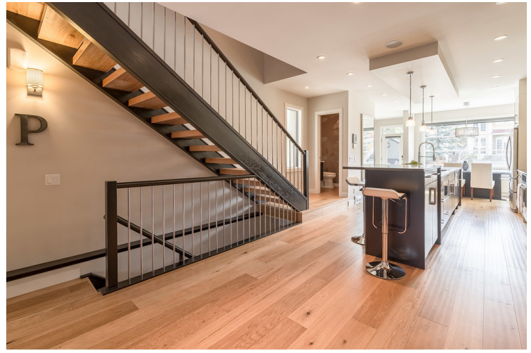
Living Room w/ coffered ceiling, built-in sound