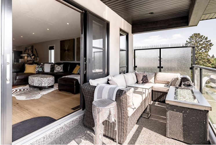
Upper covered patio with gas fire table

Enjoy front row seating to the Canada Day fireworks from the Centre St Bridge