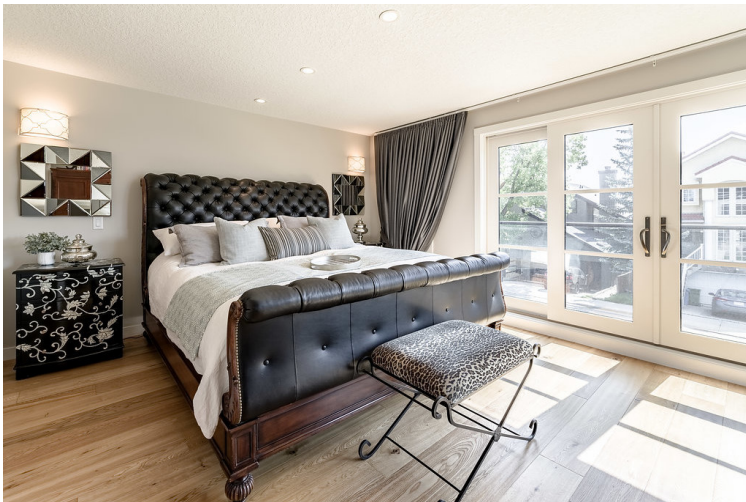
Master Suite w/ walk-in closet, patio doors, Views