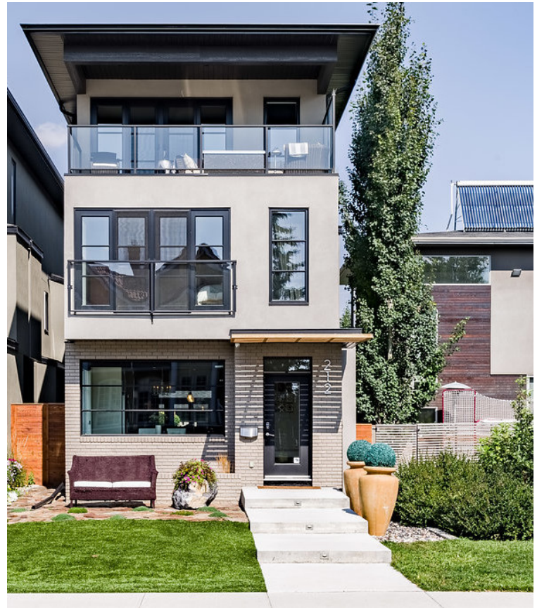
Stream lined modern living with SW views